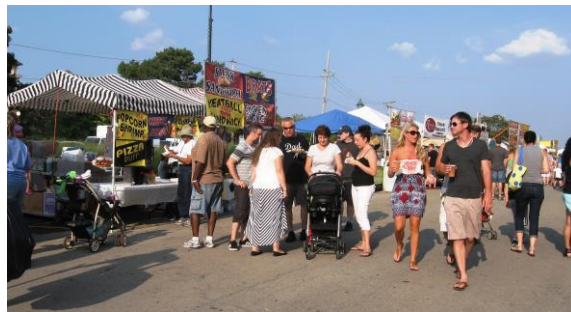
Taste of Roselle August 3 rd to August 5 th

Visit Roselle Public Library District's booth Try your luck to win prizes!